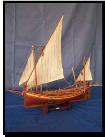
Sample of model boat in Museum Gallery - Lateen Fishing Model

The most popular scales for modeling steel ships today are 1/700 and 1/350 which have become unofficial standards. There are other scales available for builders like 1/400 and 1/600 but there is little variety in these scales. Paper models march to the beat of a different drum as scales of these ships vary widely with the greater numbers falling in the 1/250 realm. However they are available in many other scales and